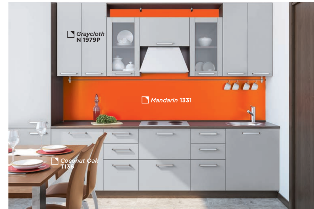
Graycloth N 1979P

“Stunning metallic matte shades for metal surfaces with good protection. It transforms dullness to liveliness almost instantly.”