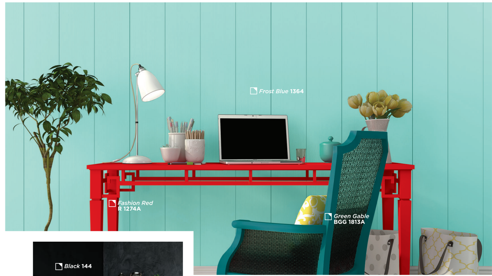
Frost Blue 1364

“Fibercote is an acrylic water-based paint with non-added lead and mercury. It is specially formulated for fiber cement surface giving it a natural wood look.”