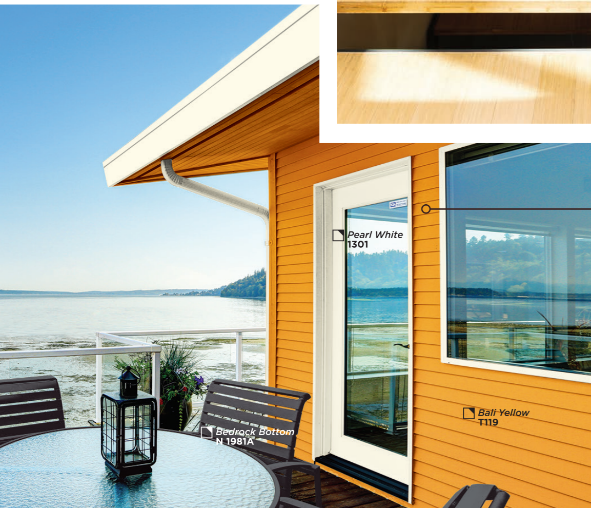
Pearl White 1301