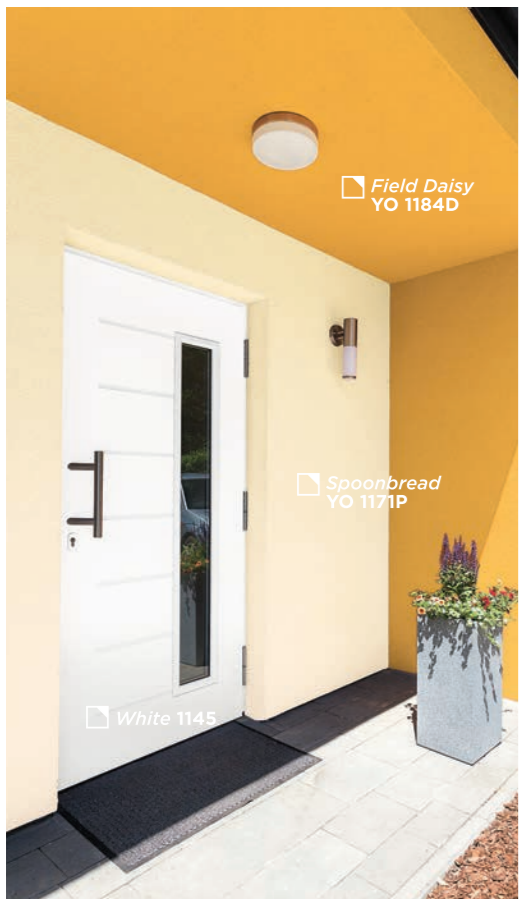
Field Daisy YO 1184D